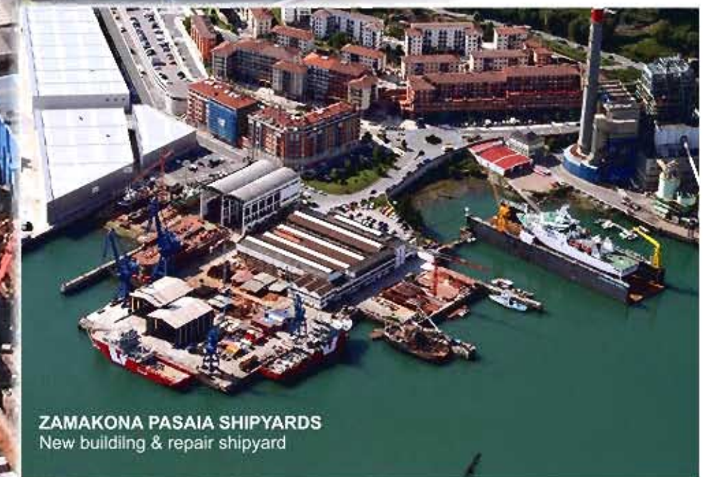
ZAMAKONA PASAIA SHIPYARDS New building & repair shipyard

"Astilleros Zamakona S.A. was founded in 1914 and has developed over the time into a group of shipyards and related firms under the name of ZAMAKONA YARDS