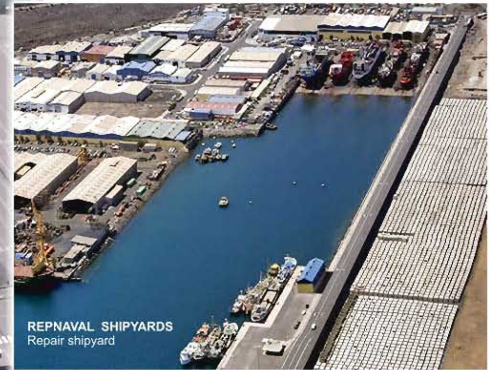
REPNAVAL SHIPYARDS Repair shipyard